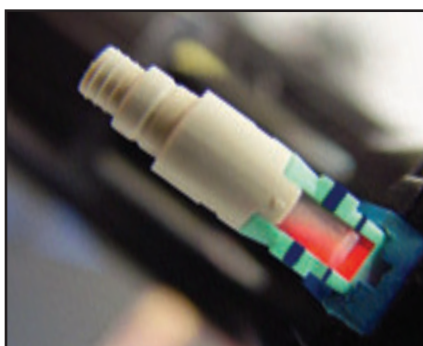
A light can be seen through the clear window on the connector body until a fiber has been properly terminated.

connector is clearly visible through the connector window, there's a very pronounced difference between the unterminated and terminated state.